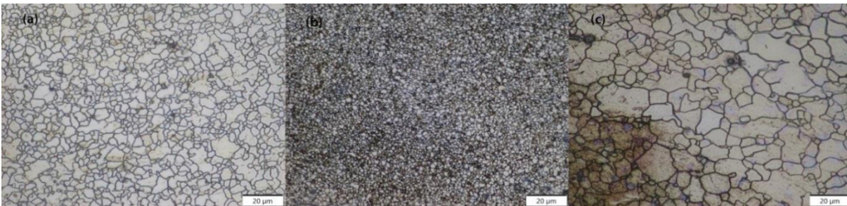
Fig. 18. Microstructures of Friction Stir Welded Joints: (a) 750 rpm, 10 mm/min, 15 mm, (b) 825 rpm, 15 mm/min, 18 mm, and (c) 900 rpm, 20 mm/min, 20 mm