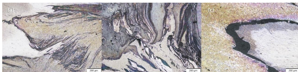
Fig. 15. Stir zone Microstructures for a) low b) middle and c) high parameter combinations

As per the Hall-Petch equation, a grain size decrease increases strength and hardness. The reduction in particle size will enhance the hardness of the material. In this scenario, the presence of fine grain in the stir zone leads to a significant increase in Microhardness. The sample of the middle parameter has a grain size of 2.33 \mu m , a tensile strength of 180 MPa, and a Microhardness of 88 HV. The grain size for the high parameter combination is 10.5 \mu m , resulting in a fall in tensile strength to 120 MPa and a decrease in hardness to 68 HV.